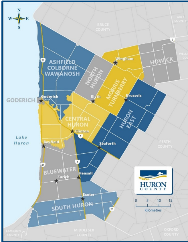
Huron County Map

The Huron County Accessibility Advisory Committee (HCAAC) serves as the Accessibility Advisory Committee (AAC) for Huron County, mandated by the Accessibility for Ontarians with Disabilities Act (AODA), 2005, S.O. 2005, c. 11 . HCAAC is dedicated to advising Huron County Council on the implementation of accessibility standards across the County's nine partner municipalities (see Appendix for HCAAC's objectives and priorities). Comprising primarily of individuals with disabilities, the committee plays a vital role in creating an accessible community by providing input on accessibility plans, site developments, and public spaces. Through education, consultation, and advocacy, the HCAAC ensures that Huron County remains inclusive and accessible for everyone.